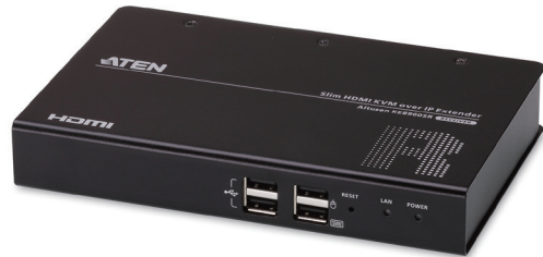
KE8900SR Front View