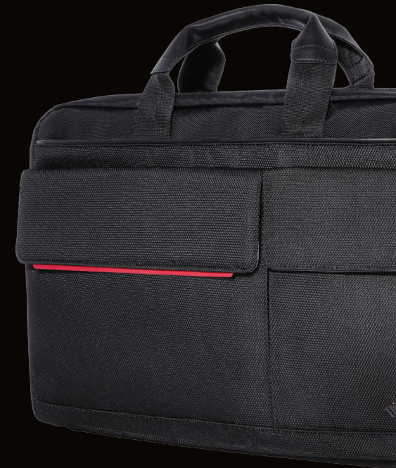
Lenovo Professional ▶ Topload Case